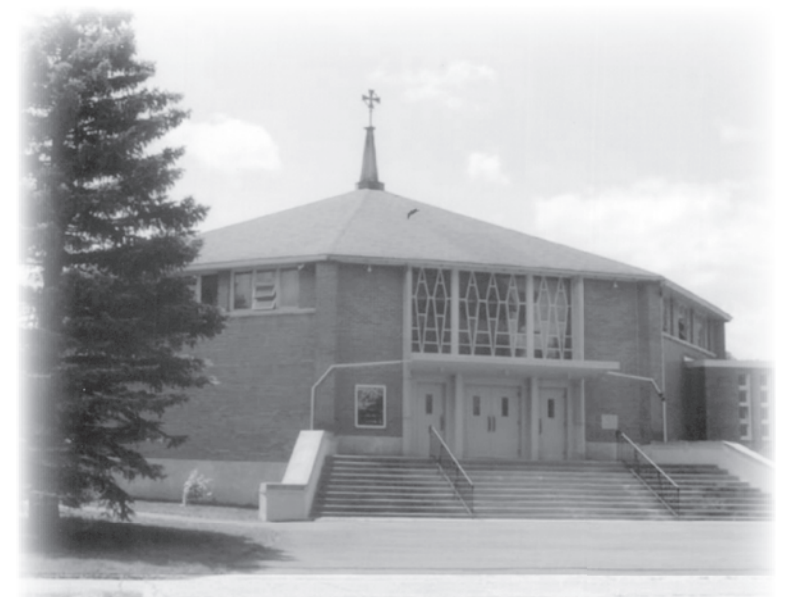
A dynamic Catholic community called by the Risen Lord to share God's love through worship, service and solidarity.

1940 Saunderson Drive, Ottawa, ON K1G 2C9 Tel: 613-733-4661 Fax: 613-733-8081