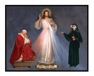
Hour of Prayer Mon. to Thurs. 3:00-4:00 p.m.

3:00 p.m. – Chaplet of Divine Mercy (sung)